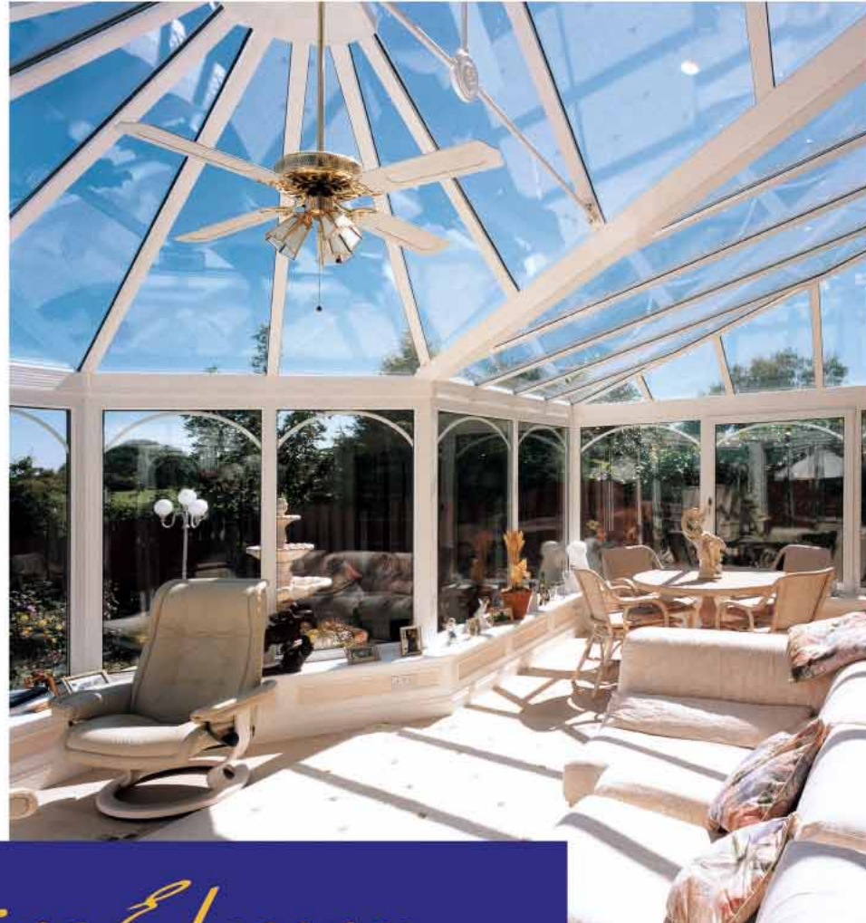
Above: Blue Diamond Systems Conservatories let you enjoy all of nature in it's most natural setting.