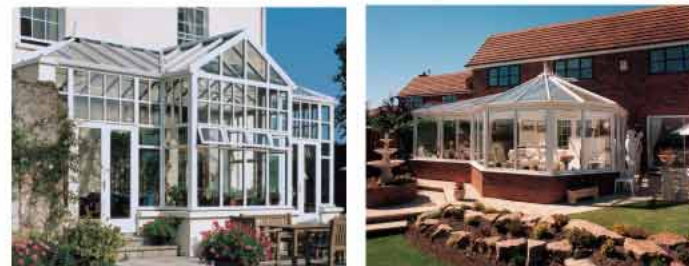
Above Left: T-Style Edwardian with Elizabethan gable front and extended lites. Above Right: This P-shape Victorian is a beautiful addition to this modest home which is eloquently landscaped.

Despite all of the sophistication and efficiency, the company still retains the touches of craftsmanship and attention to detail that make quality the most important component in every Blue Diamond Systems™ Conservatory or Portal.