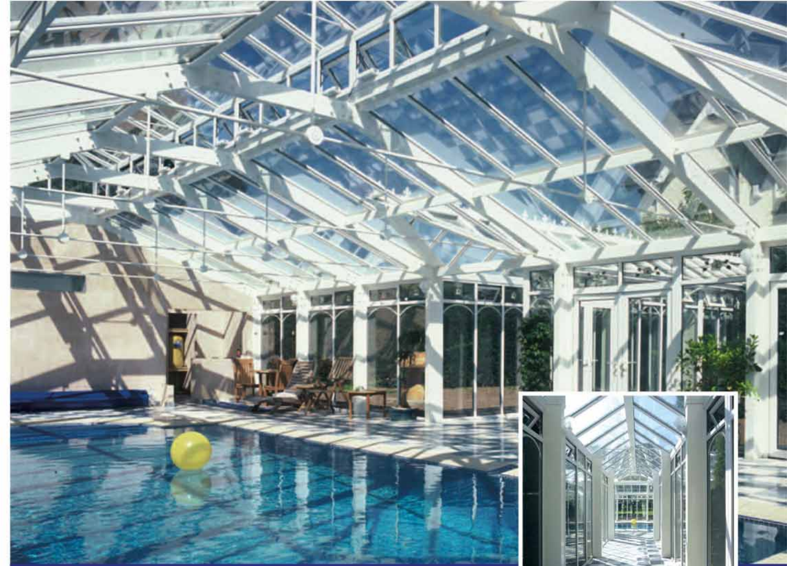
Above: Spacious Portal Pool enclosures let you enjoy the outdoors all year round.

Even though many homes in the United Kingdom feature a conservatory, the concept is still fairly new to the US market. In fact, VEKA's vertical wall systems have been used for conservatories for over 20 years in the UK.