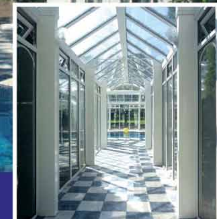
Right: Elegant atrium hallways can connect your home to outdoor living space.

To many, the word "Conservatory" may conjure up images of a greenhouse. Or perhaps, even a two or three season sunroom or patio enclosure. But, the company says Blue Diamond Systems™ and their expansive Portals are far more than any of these.