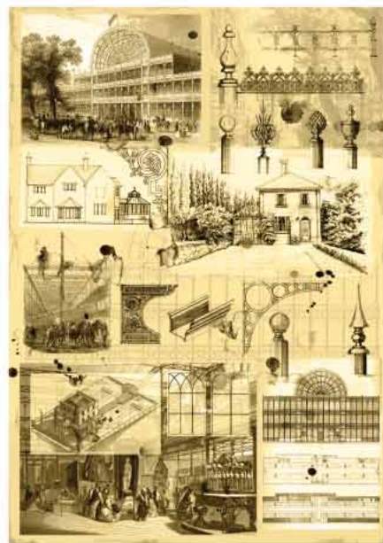
Crystal Palace Design Drawings Circa 1850