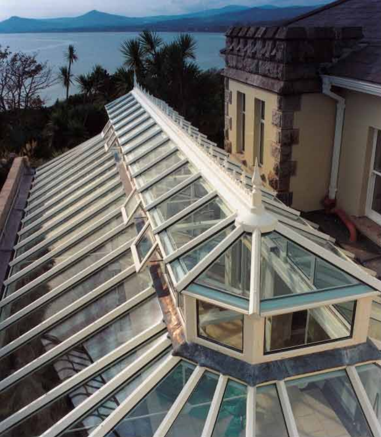
Above: This Victorian Portal with lantern roof top shows off this elegant mansion in a tropical setting.

It is an impressive showcase for entertainment or a personal retreat for rest and relaxation. A family space that makes outdoor living a comfortable, year-round activity.